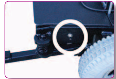
On/Off Switch for Electronic Controls