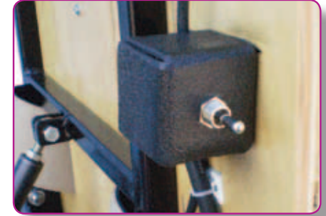
Manual Switch to Move Overboard (Up/Down)