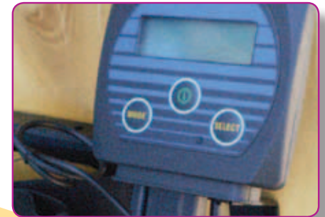
P&G Omni Interface for Switches