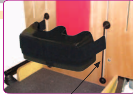
Optional Bars to KneeBlocks for Small Children